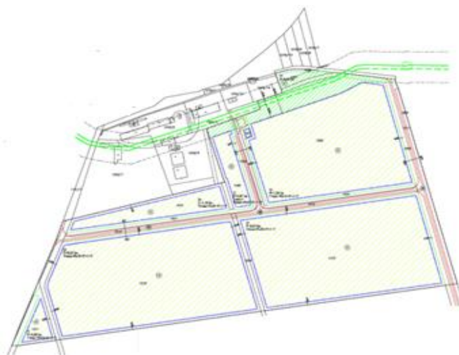
Layout of the Ind.Zone Čađavica

Note: Production and processing of meat per Halal- and Kosher-procedure